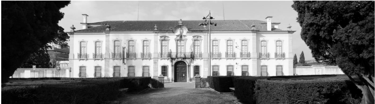
Museu da Cidade / Palácio Pimenta