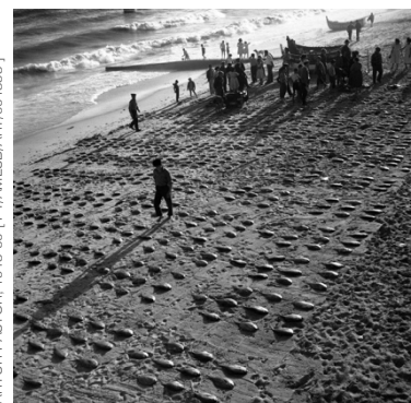
ARTUR PASTOR, 1943-60 [ PT/AMLSB/ART/001353 ]