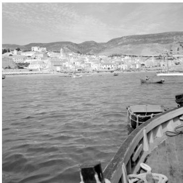
ARTUR PASTOR, 1957-61 [ PT/AMLSB/ART/000957 ]